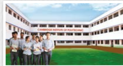
Cambridge Institute of Polytechnic Approved by AICTE, New Delhi, Affiliated to Jharkhand University of Technology, Govt. of Jharkhand