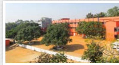
Cambridge School Affiliated to CBSE. Class- Nursery to 10+2, Residential and Day School.