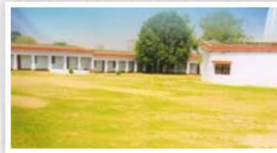
Gautam Buddha International School Affiliated to CBSE. Class- Nursery to 10th, Day School.