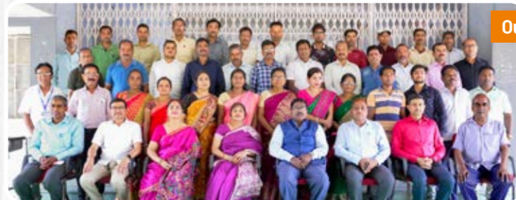
Our Non-Teaching Staff