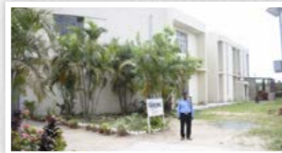
Cambridge Institute of Teachers Education B.Ed - Recognized by NCTE and Affiliated to Ranchi University, Ranchi. DL. Ed. - Affiliated to JAC.