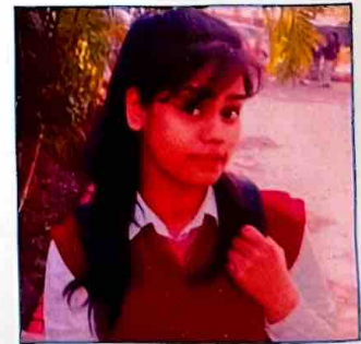
PRACHI Fab India