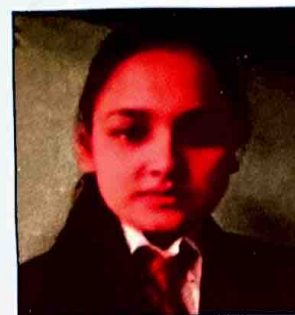
GANESHI Survey of India