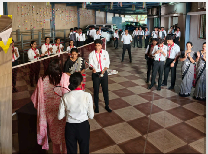
Badminton Court, Inauguration