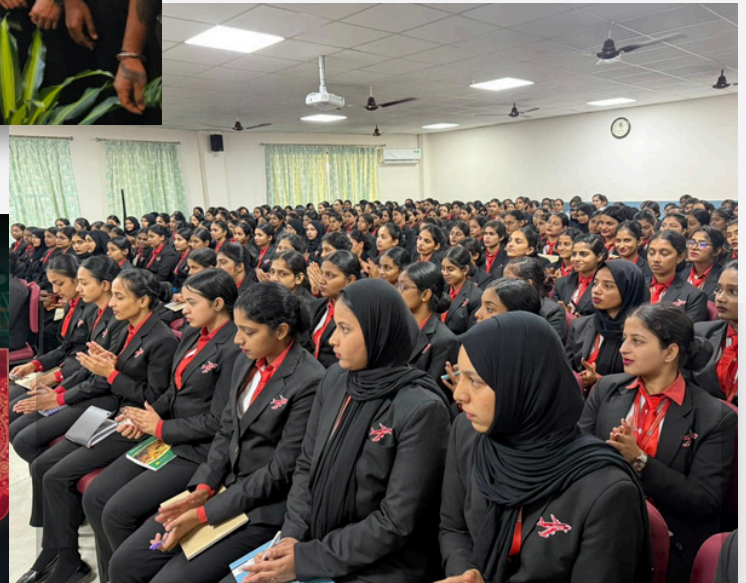
Posh Act, Guest Lecture