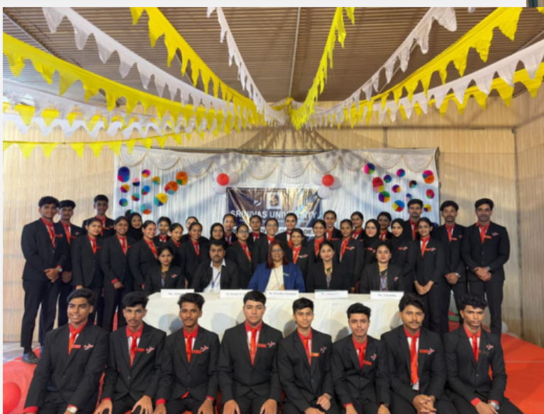
Student Council Inauguration