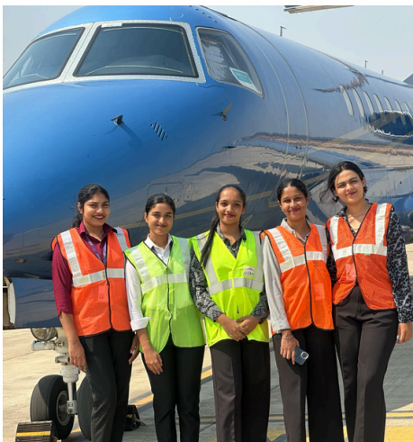
2022 Batch AM, Student Internship, Hubli Airport