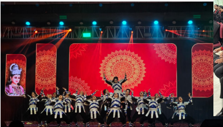
External Cultural Participation