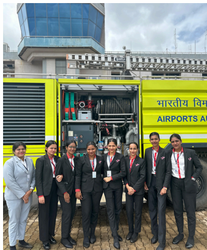
2023 Batch ALM, Student Internship, Hubli Airport

Students have gained internship exposure at prominent domestic and international airports across India , as well as in aviation, travel & tourism, and logistics-related companies.