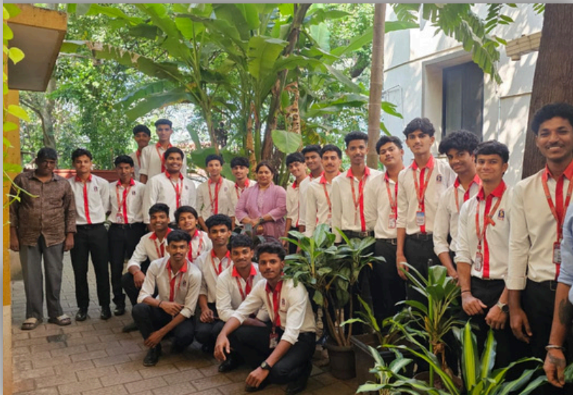
Campus cleaning NSS activity