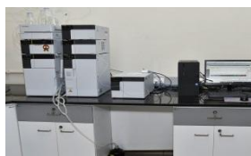
Ultra High Performance Liquid Chromatography (UHPLC)(Nexera, Shimadzu)