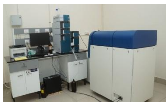
Liquid Chromatography- (JSM-7610F Plus JEOL) Spectrometer (LC-MS/MS QTOF)

The Dr. APJ Abdul Kalam Central Instrumentation Laboratory is nestled within the vibrant campus of Guru Jambheshwar University of Science and Technology, Hisar. Since its inception in the year 2000, this cutting-edge facility has been a beacon for students, research scholars, and teachers actively involved in groundbreaking R&D pursuits across the dynamic realms of Science, Technology & Engineering. Our state-of-the-art laboratory, currently housed in a modern structure spanning an area of 7212 sq.ft and adorned with modern amenities, is tailored to inspire scientific excellence. The CIL cater to the needs of the students, research scholars and teachers of this University as well as other educational and industry in order to promote research activities. Researchers from about 115 academic institutions and research centers nationwide have already experienced the transformative capabilities of our facilities. Over the years, the laboratory has acquired sophisticated equipment funded by the DST under the PURSE program and MHRD under the RUSA scheme. Apart from supporting researchers through sample testing, the CIL conducts training programs for skill upgrading of research scholars and capability enhancement of technical staff. The CIL is presently having sophisticated Instruments like –