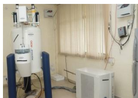
FT-NMR Spectrometer (400MHz Bruker)