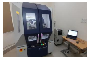
Multipurpose versatile XRD System (Smart Lab 63kW, Rigaku)