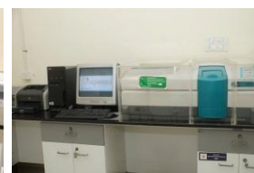
UV-VIS –NIR Spectrometer (Cary 5000, Varian)