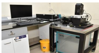
Confocal Raman Microscope (Alpha 300R, WITec GmbH)