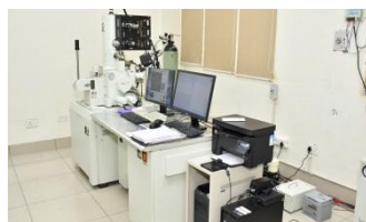
Mass High Resolution Field Emission Scanning Electron Microscope with EDS (FE-SEM)