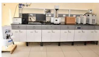
Research Grade Advance Rheometer System (MCR 302e Anton Paar)