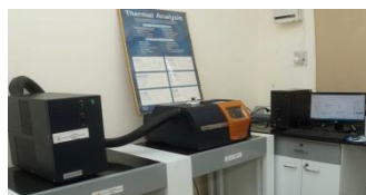
Differential Scanning Calorimeter (DSC 25) TA Instruments