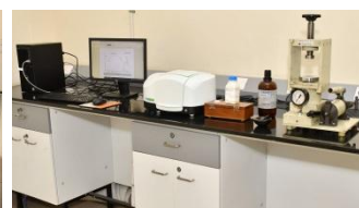
FTIR Spectrometer (Spectrum Two, Perkin Elmer)