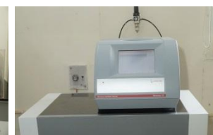
Microwave Synthesizer (Monowave 200, Anton Paar)

The CIL cater to the needs of the students, research scholar and teachers of this university as well as other educational institute and industry in order to promote research activities.