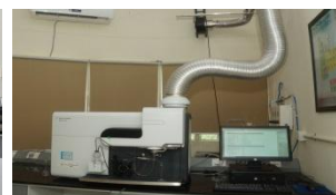
Microwave Plasma Atomic Emission Spectrometer (MP-AES Agilent 4210)